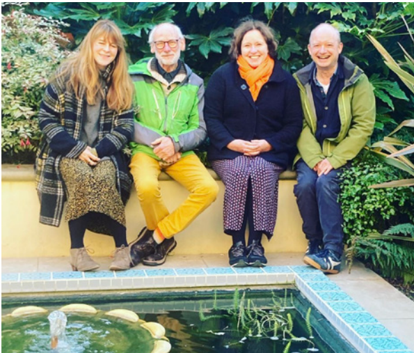
Fitzwilliam String Quartet

For further information regarding the Strings in Spring course, and to apply, please visit www.st-andrews.ac.uk/music/all/short-courses/strings-in-spring