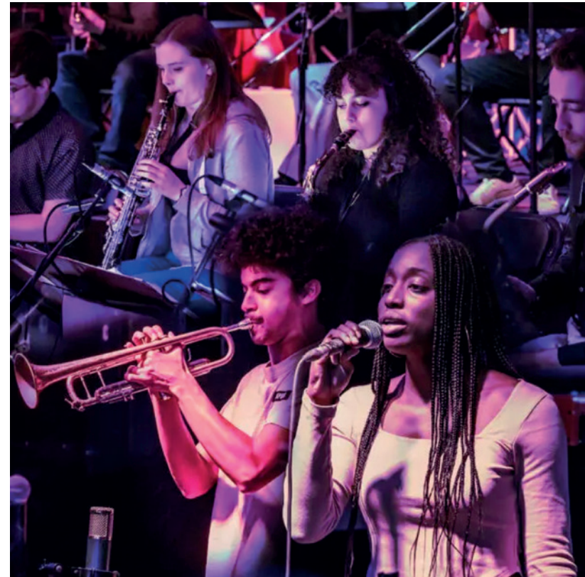
Tommy Smith Youth Jazz Orchestra

www.snjo.co.uk/tommy-smith-youth-jazz-orchestra