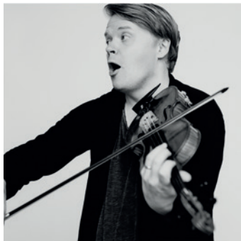
Pekka Kuusisto