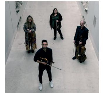
Routes String Quartet © Paul Jennings