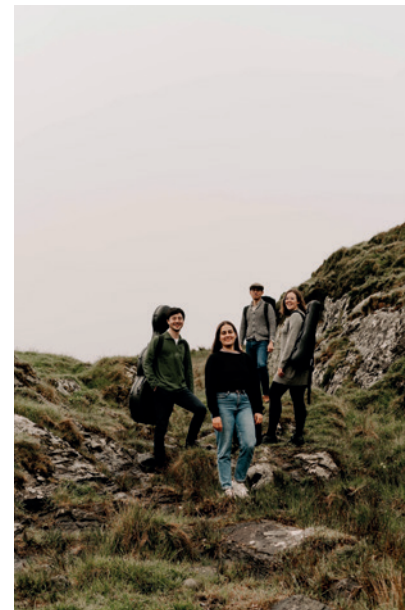
Resol String Quartet