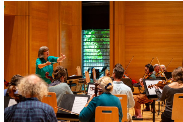
St Andrews and Fife Community Orchestra