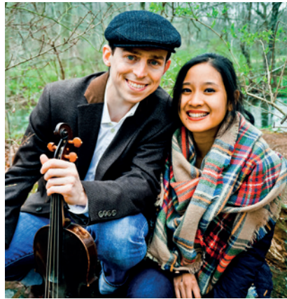
The Highlands Duo